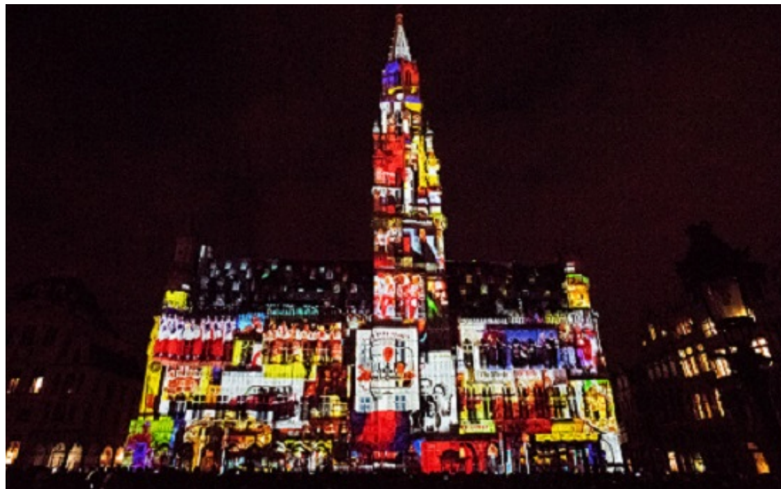
"Launch of European Year of Cultural Heritage in Belgium"

The year was launched at the European Culture Forum in Milan on 7 December 2017. Watch the video . Since then, a number of interesting events have taken place across Europe to kick off the year. These